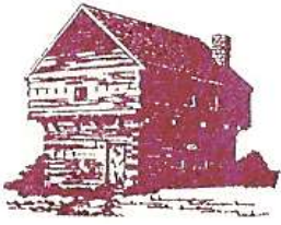
Stillwater NY 1788